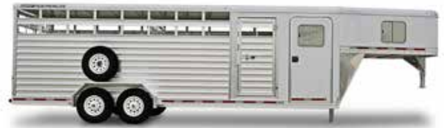
Model 8417 Combo. The gooseneck combo trailer measures an easy-to-tow 6'7" wide, is available in lengths of 16', 20' and 24' and includes a slant or straight wall dressing room. The trailer comes standard with a wood floor, escape door and full swing rear gate. Shown with optional spare tire.