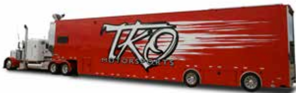
Race/Car Hauler. Haul multiple vehicles with work area, lounge and upper deck.