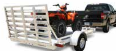
Model 1693. Open utility/rec trailer Model 1693 with rear ramp is available in 10', 12' or 14' lengths and is available with optional side ramp & side kit.