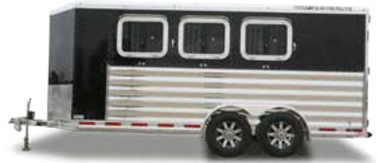
Model 9409. This bumper pull is available in a 2, 3, or 4-horse slant load configuration with dressing room choices of 2', 24" or 52". Trailer includes double rear doors with pipe hardware and no center post. Shown with optional polished wave side panels, aluminum wheels, black side sheets and more.