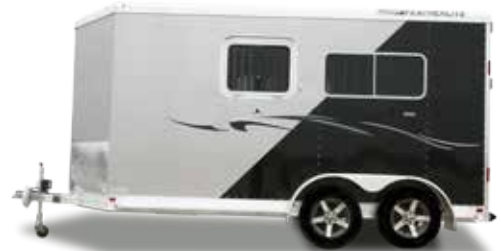
Model 9407. 2H straight load available in several floorplans, including an option with mangers and walk-through door. Side and rear ramp floorplans available. Choose from 41" or 48" dressing room. Shown with dual sides, aluminum wheels and graphics.