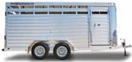
Model 8107 with low profile option plus red plexiglass, upgraded tires, silver front sheets and graphics shown below.

Model 8107. Bumper pull stock trailer with aerodyne nose. Available in standard or low-profile heights (5'3").