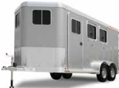
Model 9551. Slant load can be configured to hold 2 to 4 horses with a 7', 7'6" or 8' width. Choose 40" stalls or 50" for bigger horses. The trailer has a standard side load door on 3H & 4H models. Dressing room short wall options range from 24" to 56". Shown with optional silver side sheets and orange paint.