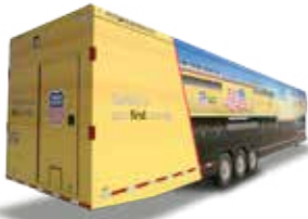
Classroom & training trailers. Go onsite for training & educational seminars.