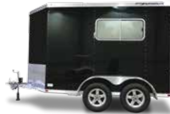
Model 9401. Use this 2-horse trailer as a slant load or straight load with movable divider/wall. Add optional ramp for easy loading of other cargo. Measures 6'7" wide, 10' long and 7' tall. Shown with optional black sides and aluminum wheels.