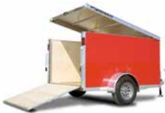
Model 1609 Mod Pod. The Model 1609 'Mod Pod' is a low-profile trailer that is versatile for hauling with a wide variety of vehicles. It can be used to haul gear for camping, hunting, fishing, vacationing or just general everyday hauling. It features a rear ramp and flip-top roof for easy access to the cargo. Available in 8' and 10' lengths.