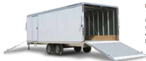
Model 1648 Snowmobile. Model 1648 snowmobile trailer boasts a rear ramp with cable assist, a front ramp to make loading and unloading easier, and a front radius nose. The length ranges from 12' to 24'.