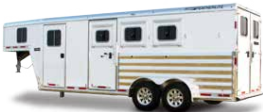
Legend Edition Model 8542 is a slant load available in widths of 7' or 7'6" in 2 to 6 horse floorplans. It features square cornered windows and doors and one tie ring per horse per side.