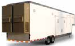
Mobile Lab. On site medical, research or response unit.