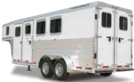
Model 8533. Gooseneck trailer is available as a 2, 3, 4 or 5-horse trailer with dressing room options of 42", 67", 91" and 115". Also available with living quarters or mid tack.