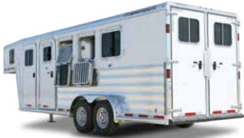
Model 8541. This slant load can be customized to hold 2 to 6 horses and offers many dressing room sizes. Model 8541 comes standard with white aluminum lining in the horse area and is available in widths of 7' or 7'6". Also available with living quarters.