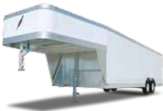
Model 1641. A versatile hauling option for your cars, ATVs, motorcycles, household items and much more! The trailer features a convenient rear ramp with cable assist and a durable 3/4" plywood floor.