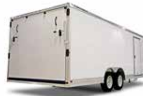
Model 1611. Recreation trailer Model 1611 measures 7' or 8' 6" wide for versatile hauling of all types of recreational vehicles & equipment.