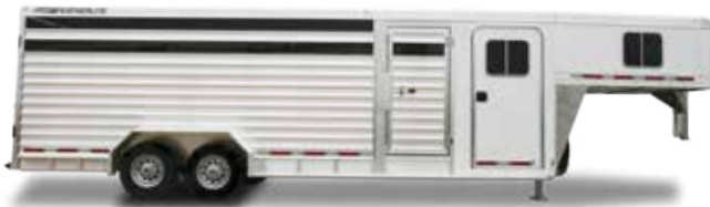
Model 8413 Combo. For horses, cattle or other livestock, versatile Model 8413 combo trailer is available with either slant wall or straight wall dressing room. Lengths from 16' to 32'. Shown with optional plexiglass.