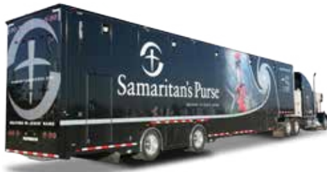
Mobile Disaster Response. Relief organizations can respond quickly to disasters.

Custom design a specialty trailer to your exact hauling requirements.