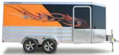
Model 1610. Recreation trailer Model 1610 features premium Featherlite Advantage wood flooring to better protect your cargo and the trailer's interior. An expanded selection of options and lengths are available.