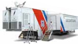
Mobile Command Center. Mobile response unit.