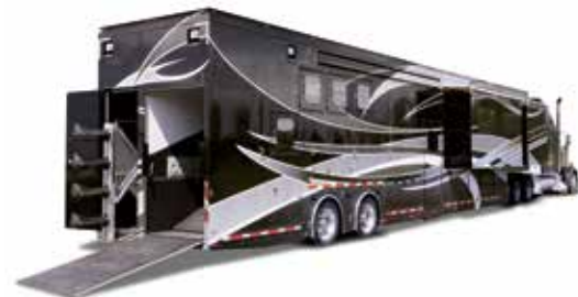
53' Country Estate. Semi horse trailer that is fully customizable and available with or without living quarters. As shown above, includes 33' LQ with four slideouts.