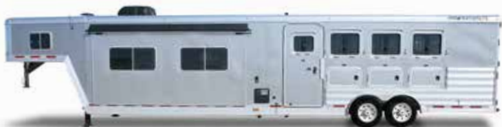
Model 8581. Featherlite's fabulous living quarters model is available with many floorplans and with 2 to 6 horse stalls. Trailer is fully customizable. Horse area features standard white aluminum lining for brighter interior. Shown with many options.

* Some models shown with previous style windows and feed doors. 2016 horse trailers feature redesigned feed doors and smoked glass windows.