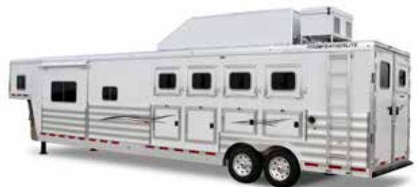
Model 8582 The rugged Legend Edition Model 8582 living quarters is 8' wide and 7'6" tall. Various floorplans for your living quarters available. Heavy duty trailer features square cornered drop down feed doors and camper doors.