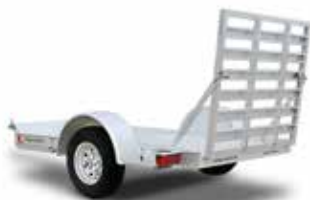
Model 1683. Open rec trailer Model 1683 with rear ramp available in 8 ft. length.