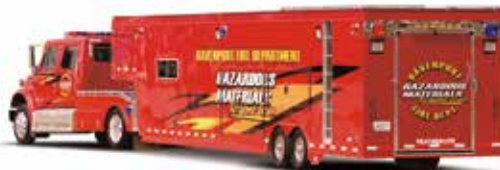
Mobile HazMat Trailer. Quick response.