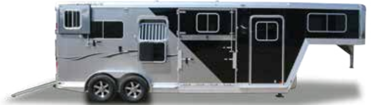
Model 9607. Straight load trailer is 6'7" wide with an inside height of 7'6". Trailer available with numerous floorplans that include options of feed mangers and side ramps. Shown with side ramp option.