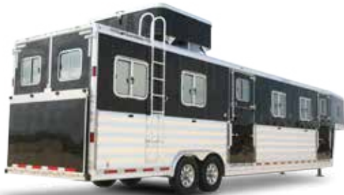
Model 9810. Model 9810 is a straight load 6-horse. It features a tack room and ramps on both sides of the trailer. Shown with many options including hay rack and black side sheets. 9-horse configuration optional!